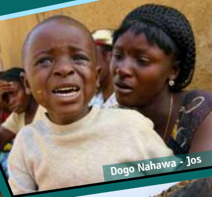
Dogo Nahawa - Jos